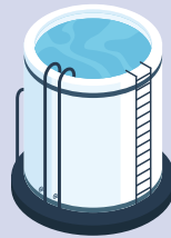
OH / UG water tanks