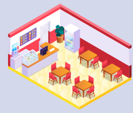
Canteen & Pantry