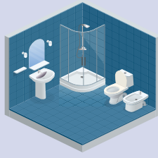
Bathroom & Toilet