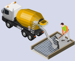
Concrete & Screed

SMARTBLOK WB EP PRIMER is a two-component epoxy based primer with good penetrating properties for concrete surfaces. It is ideal for priming concrete surfaces prior to the application of any of the resin based floor toppings protective coatings or epoxy repair mortars.