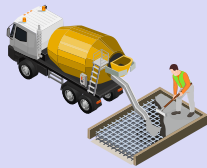
Concrete & Screed