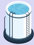
OH / UG water tanks