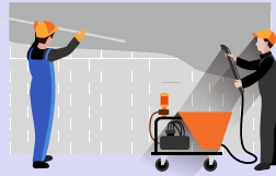
External & Internal plastering