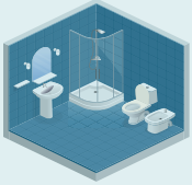
Sunk & Non Sunk Wet Areas

JSW SmartBlok SBR Ultra Plus is a selective eco-friendly styrene butadiene latex based High-performance polymeric material. This is ready to use for multi-purpose water proofing applications at leakage and seepage prone locations of new constructions including bathroom, toilet, water tank, small terraces etc. Addition of this material provides improved adhesion at old to new concrete and plaster. It is a universal repair product for concrete and masonry repair.