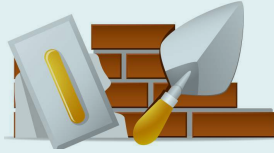
Bonding Agent for Old to New Concrete/Mortar