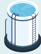
OH / UG water tanks