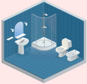
Sunk & Non Sunk Wet Areas

JSW SmartBlok Universal Polymer is a modified acrylic emulsion based material. This material is specially designed for exterior water proofing. Addition of this material provides improved adhesion at old to new concrete and plaster. It is a universal bonding material for concrete and masonry repair.