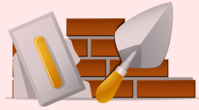
Bonding Agent for Old to New Concrete/Mortar