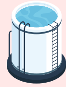
OH / UG water tanks