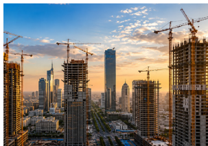
Premium residential buildings