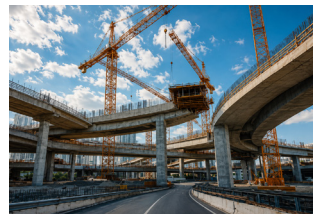
Infrastructure that grows stronger with time