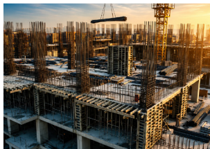
Beams and columns