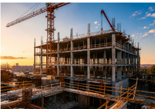
Structural RCC works