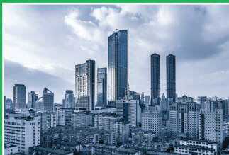
High Rise Building