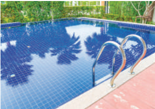
Water Tanks, Pools, & Reservoirs