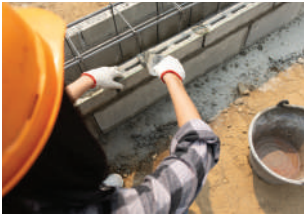
Basements & Foundations

Perfect for places exposed to water, moisture or bad weather.