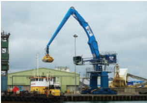
Marine & Coastal Structures