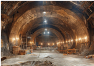
Tunnels & Underground Pits