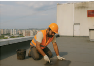
Roofs & Outside Walls