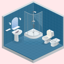
Bathroom & Toilet