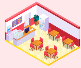
Canteen & Pantry