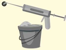
Filling of Tie Rod Hole

JSW SteelGrout - Gun Grade Mortar is recommended for filling of tie rod hole/slit holes in concrete and natural stones.